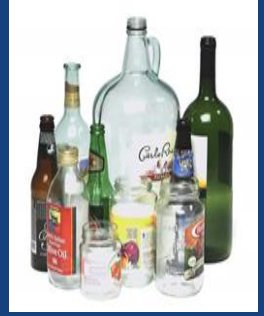
Glass Bottles & Jars (Botellas y frascos de vidrio)

Questions or comments please call WCA at 281-368-8397