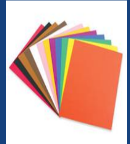
Colored Paper (Papel de color)