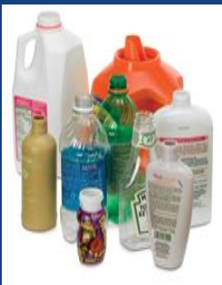
Plastics #1 - #7 (Botellas de plastico #1 - #7)