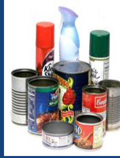
Steel and Tin Cans (Latas de hojalata y fierro)