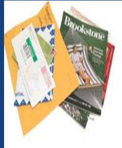
Junk Mail (Correo no deseado)