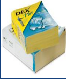
Phone Books (Directorios)