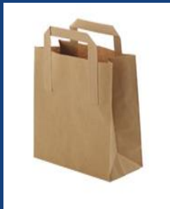
Paper Bags (Bolsas de papel)