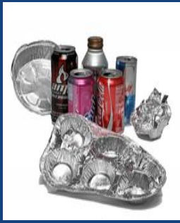
Aluminum Cans & Foil (Latas de aluminio y papel aluminio)